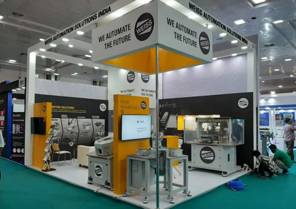
Automotive Engineering Show 2019, Chennai