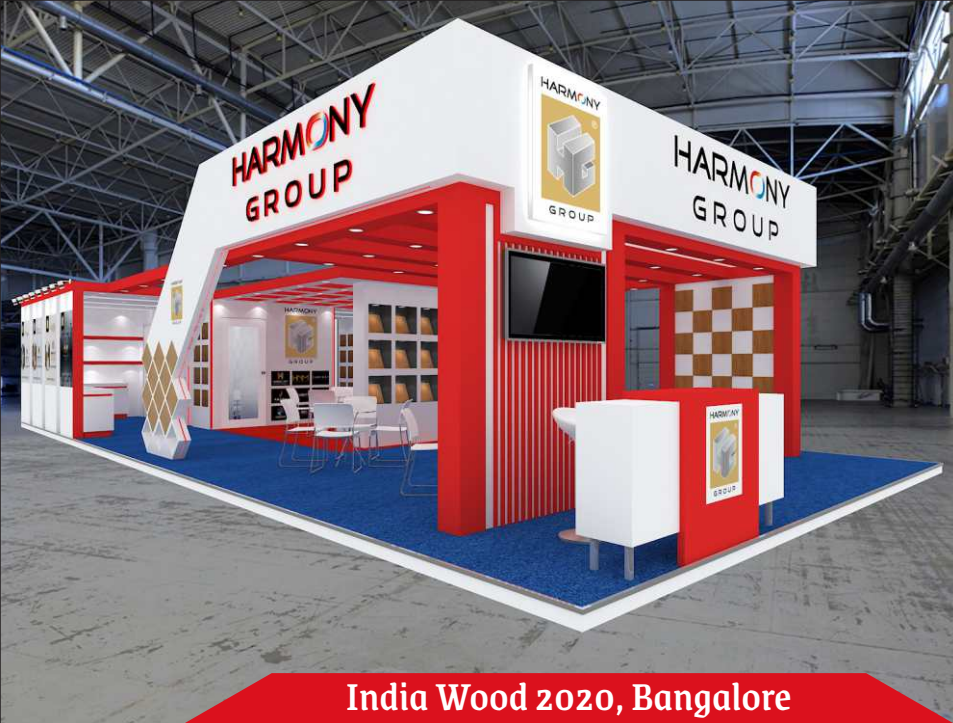
India Wood 2020, Bangalore