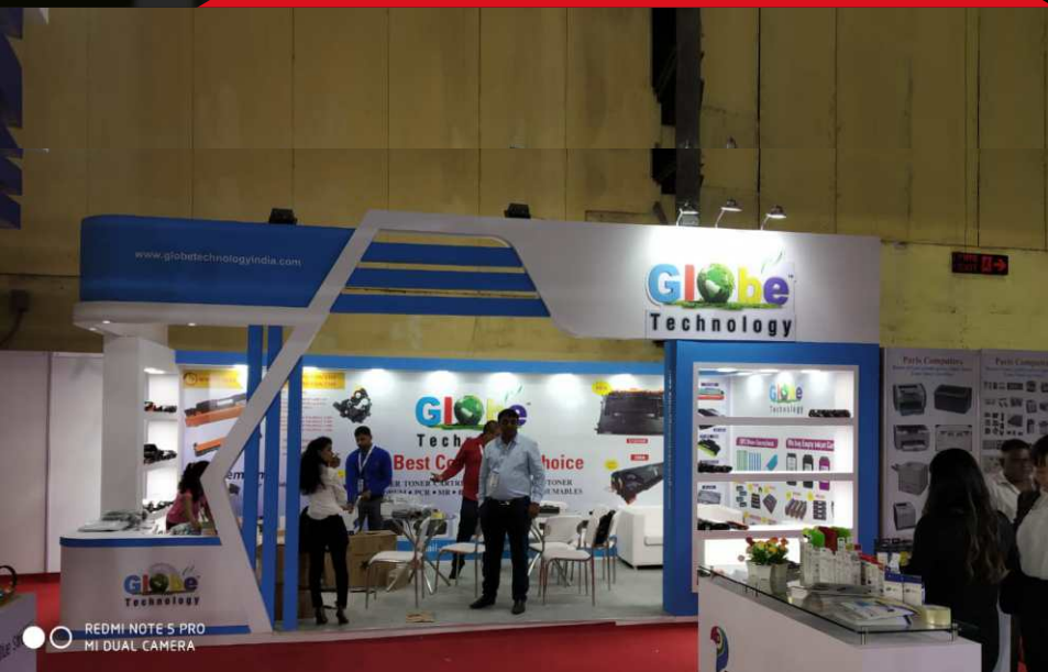
Indian Recharge Expo 2019, Mumbai