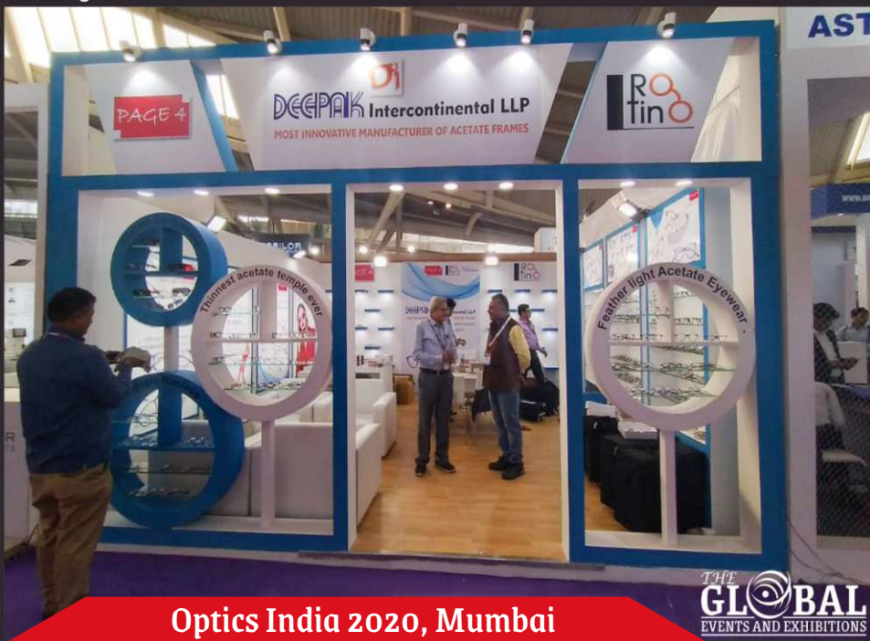
Optics India 2020, Mumbai