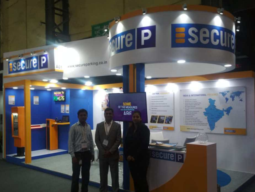
Traffic Infra Tech 2019, Mumbai