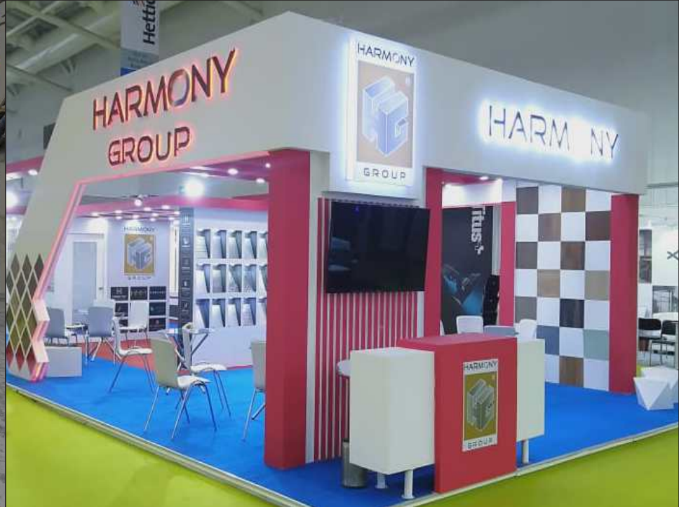
India Wood 2020, Bangalore