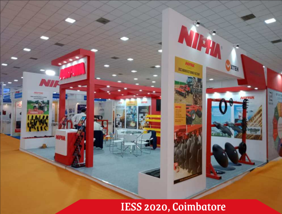
IESS 2020, Coimbatore