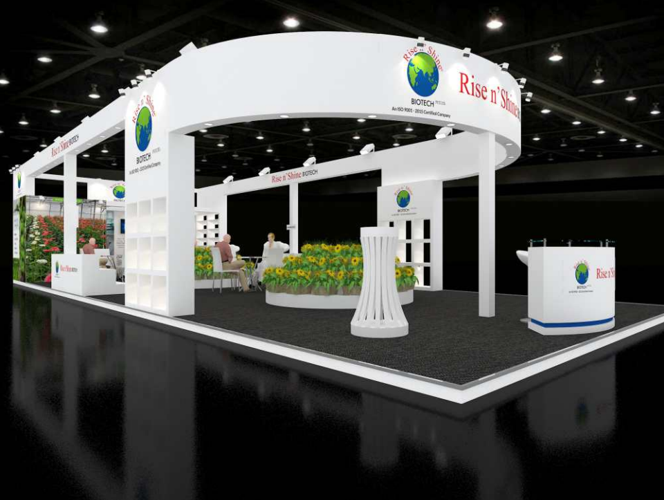
BC India 2015