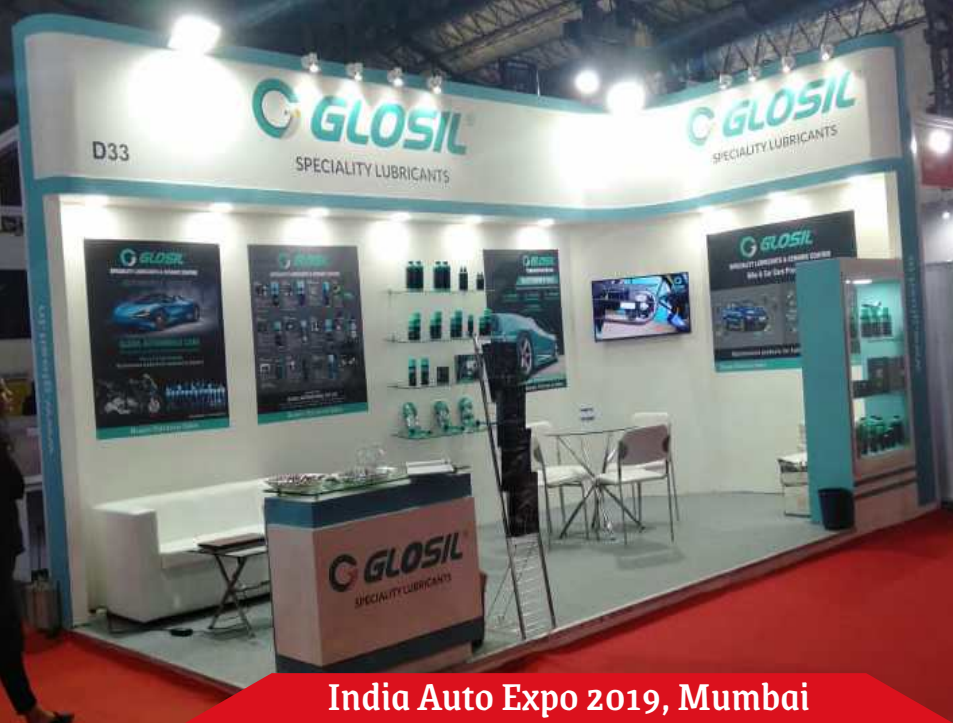
India Auto Expo 2019, Mumbai