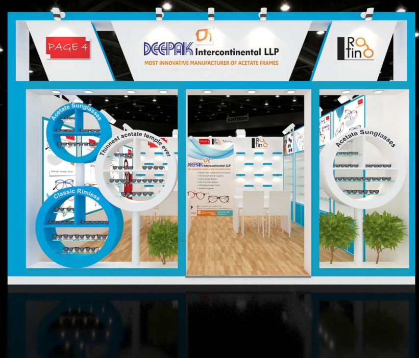
kisan expo 2019, Pune