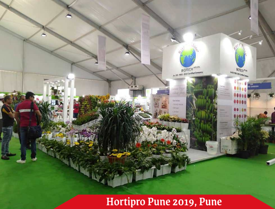
Hortipro Pune 2019, Pune