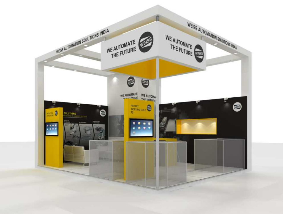
Automotive Engineering Show 2019, Chennai