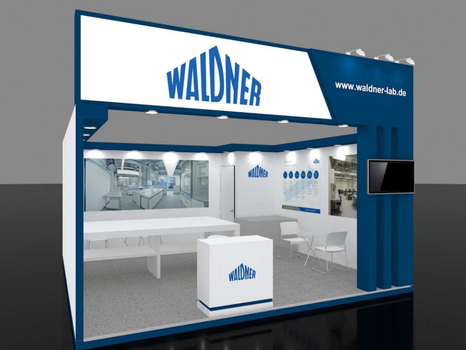
Elecrama 2020, G Noida