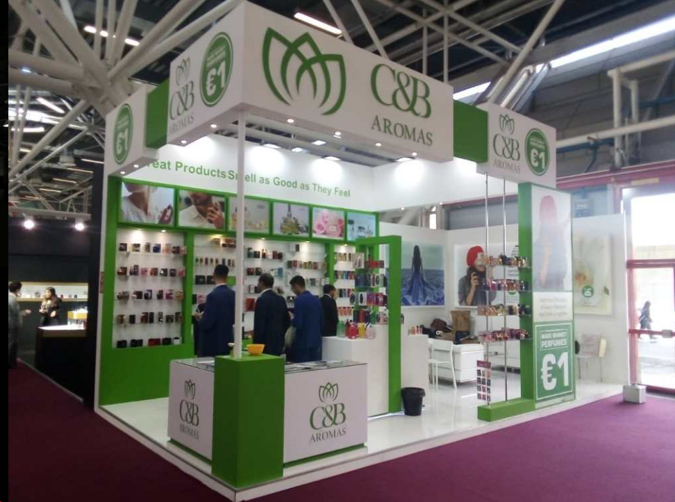
ITMA Barcelona, Spain 2019