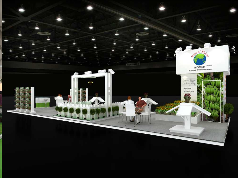
Agri-Tech 2019, Hyderabad