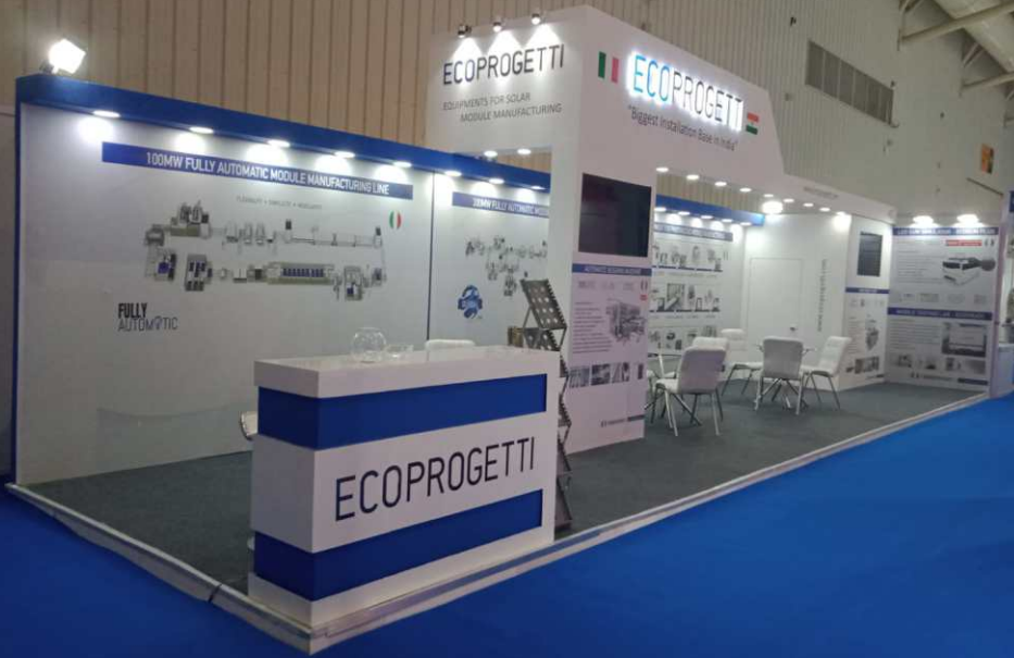
INTERSOLAR 2019, Bangalore