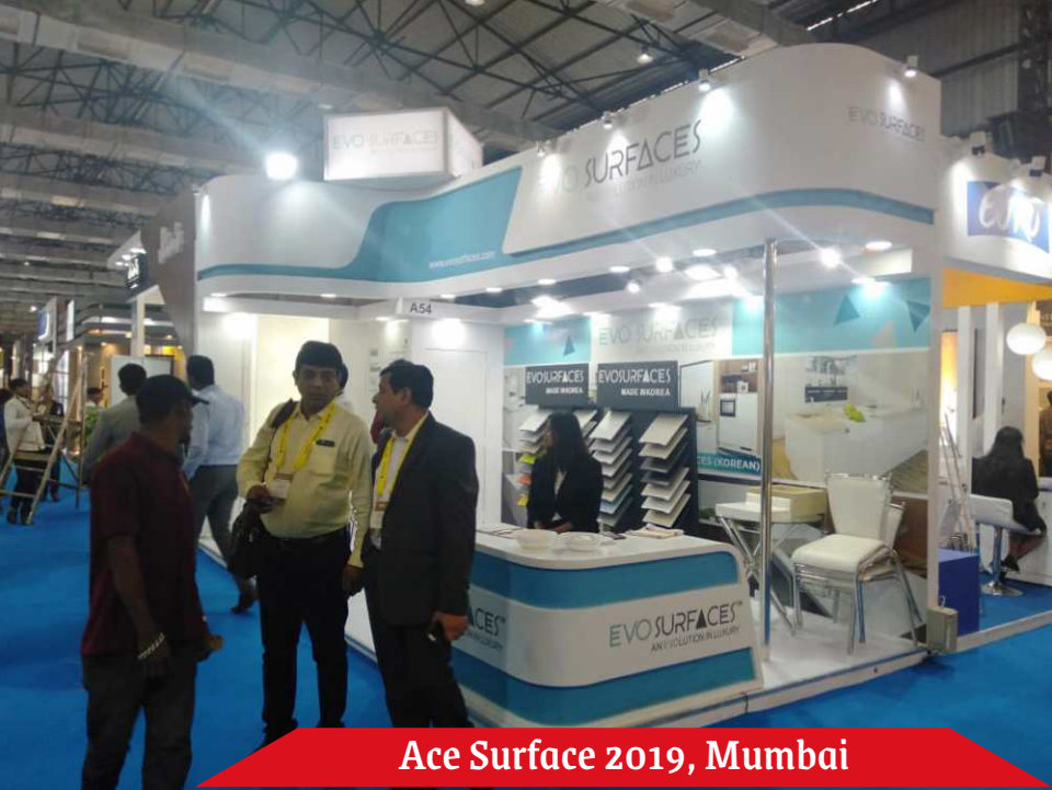
Ace Surface 2019, Mumbai