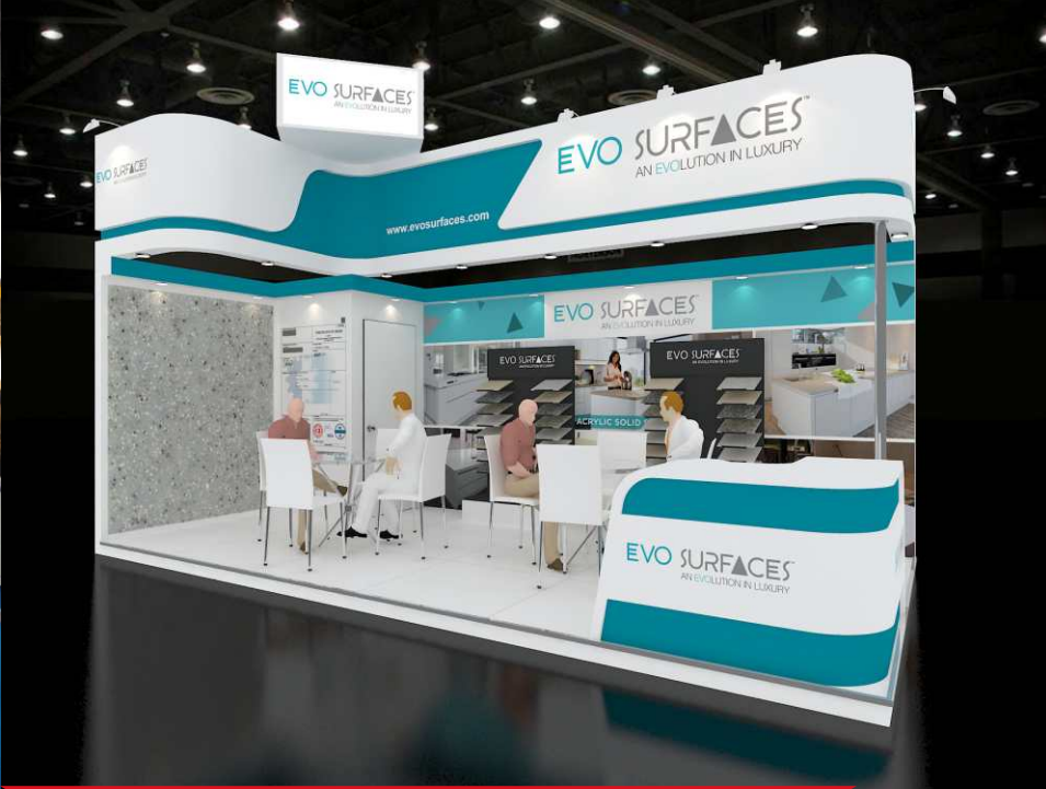
Ace Surface 2019, Mumbai