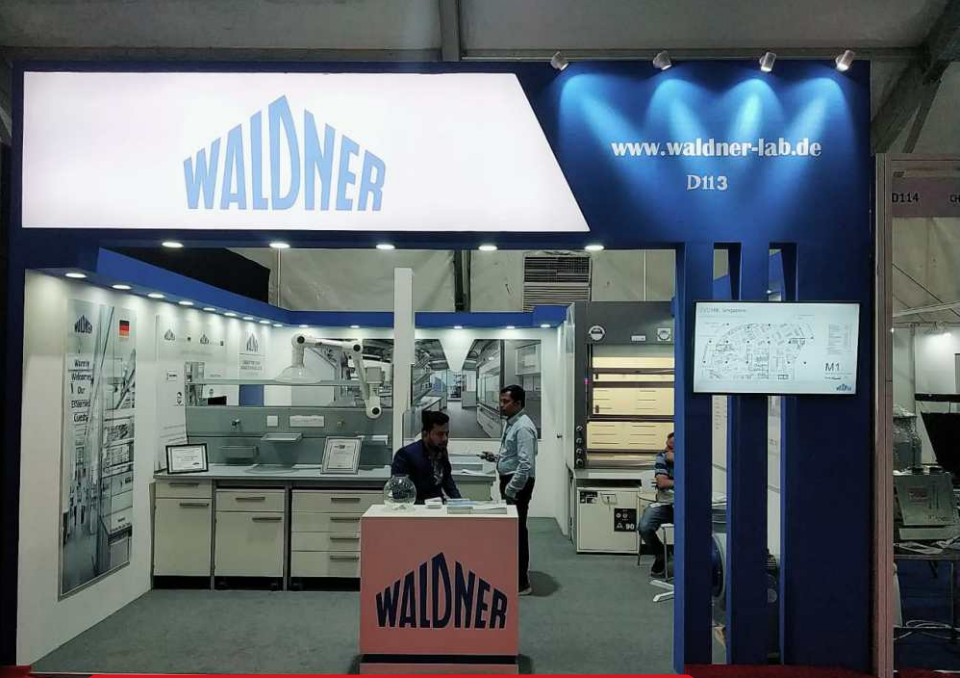
Asia pharma Expo 2020, Bangladesh