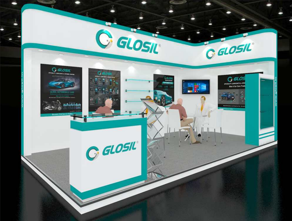
India Auto Expo 2021, Mumbai