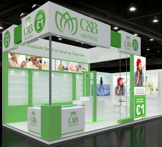
Cosmoprof Worldwide, Italy 2019