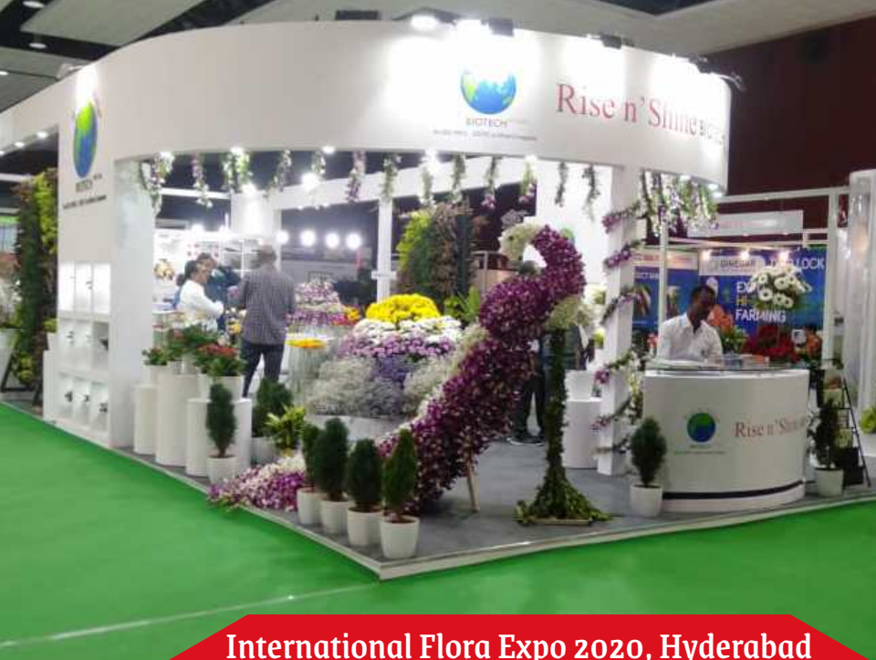
International Flora Expo 2020, Hyderabad