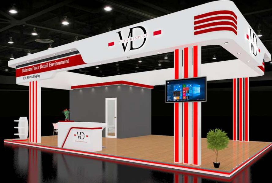
Indian Recharge Expo 2019, Mumbai