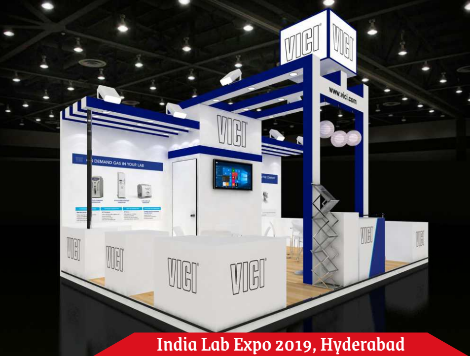
India Lab Expo 2019, Hyderabad