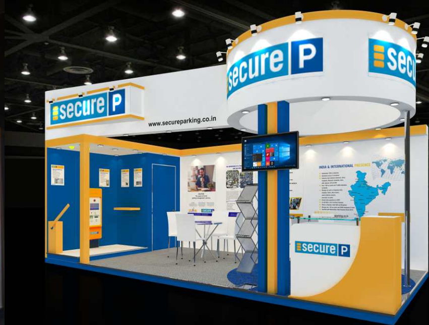
Anuga 2019, Germany