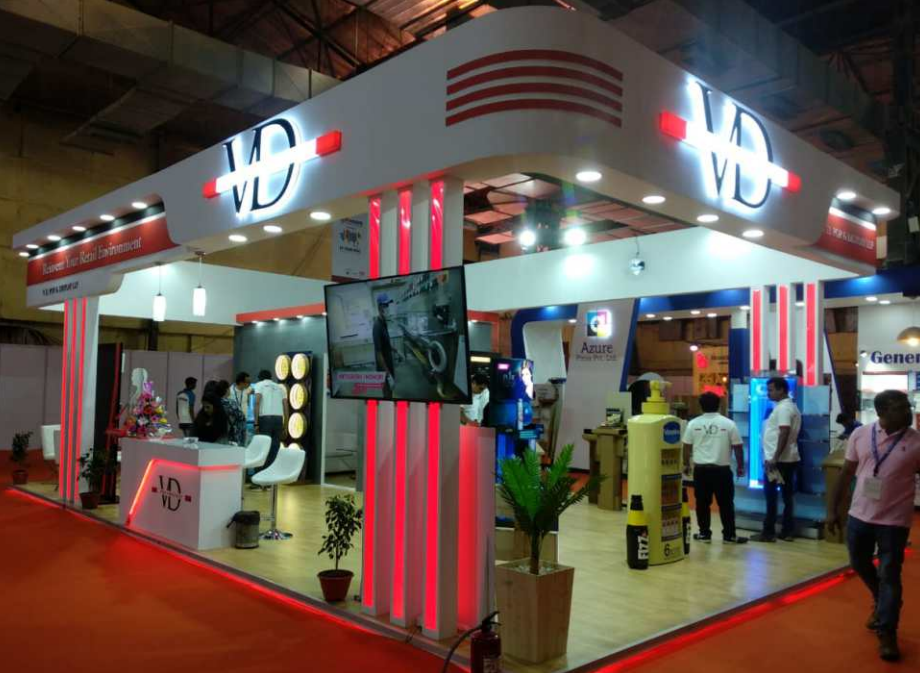
In_Store Asia 2019, Mumbai