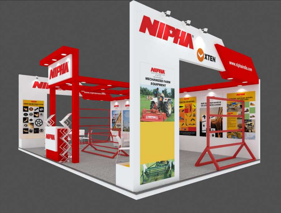
ASIA COAT INK SHOW 2019