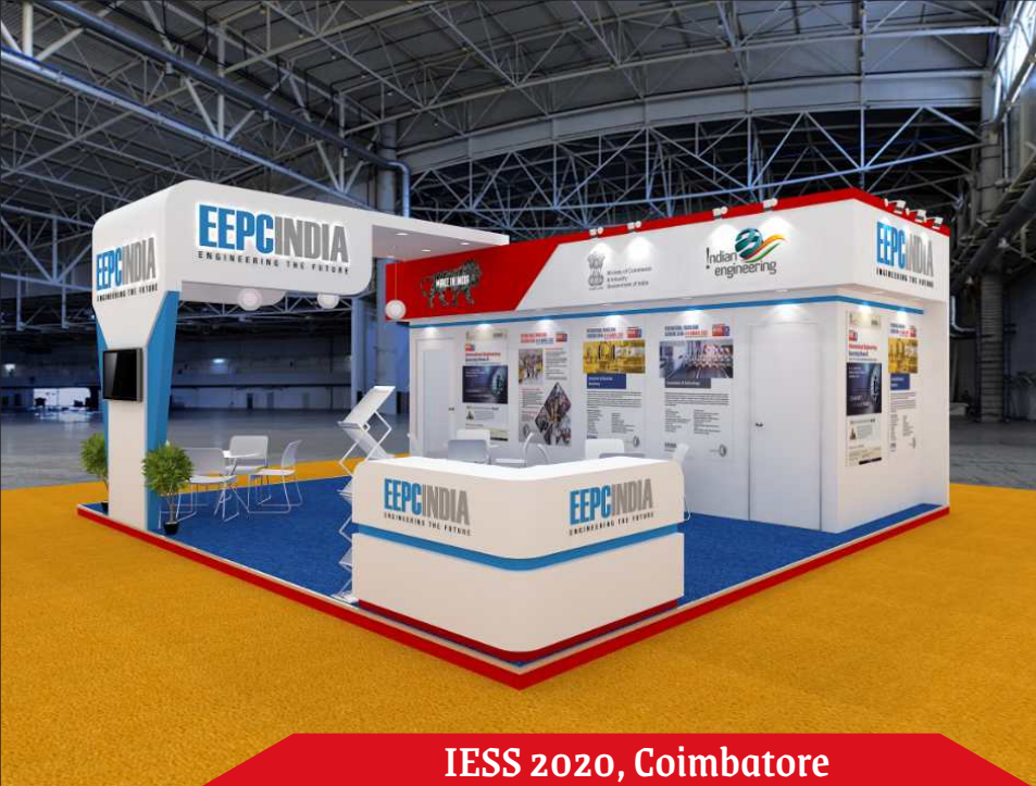
IESS 2020, Coimbatore