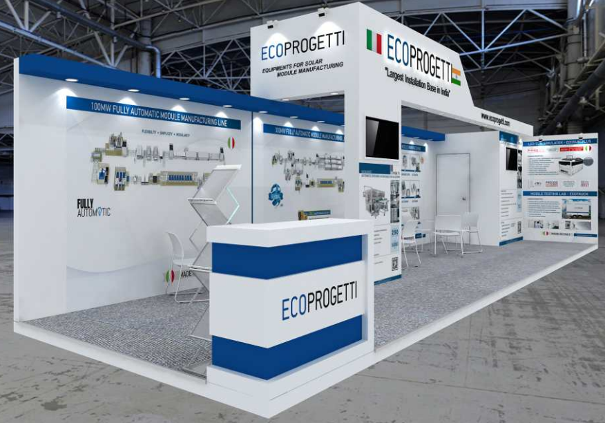
INTERSOLAR 2019, Bangalore