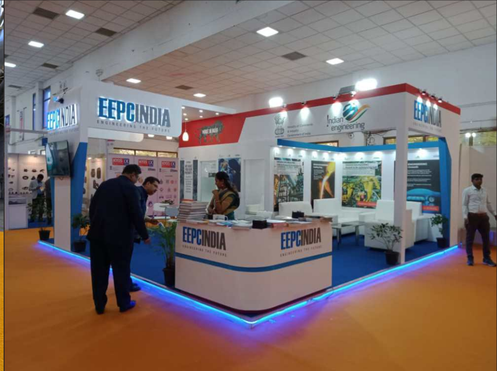
IESS 2020, Coimbatore